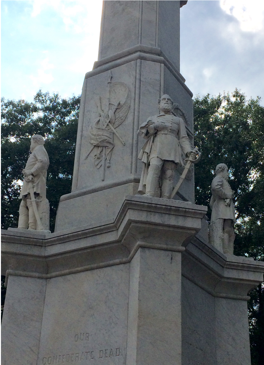
Figure 2: Detail of Statues at Base of Augusta Monument

sculptors making promises about deadlines they could not keep was a common trend amongst LMA Confederate monument projects. Ultimately, the Augusta monument was not in place until November of 1878, several months after Memorial Day. A similar situation would happen in Atlanta.