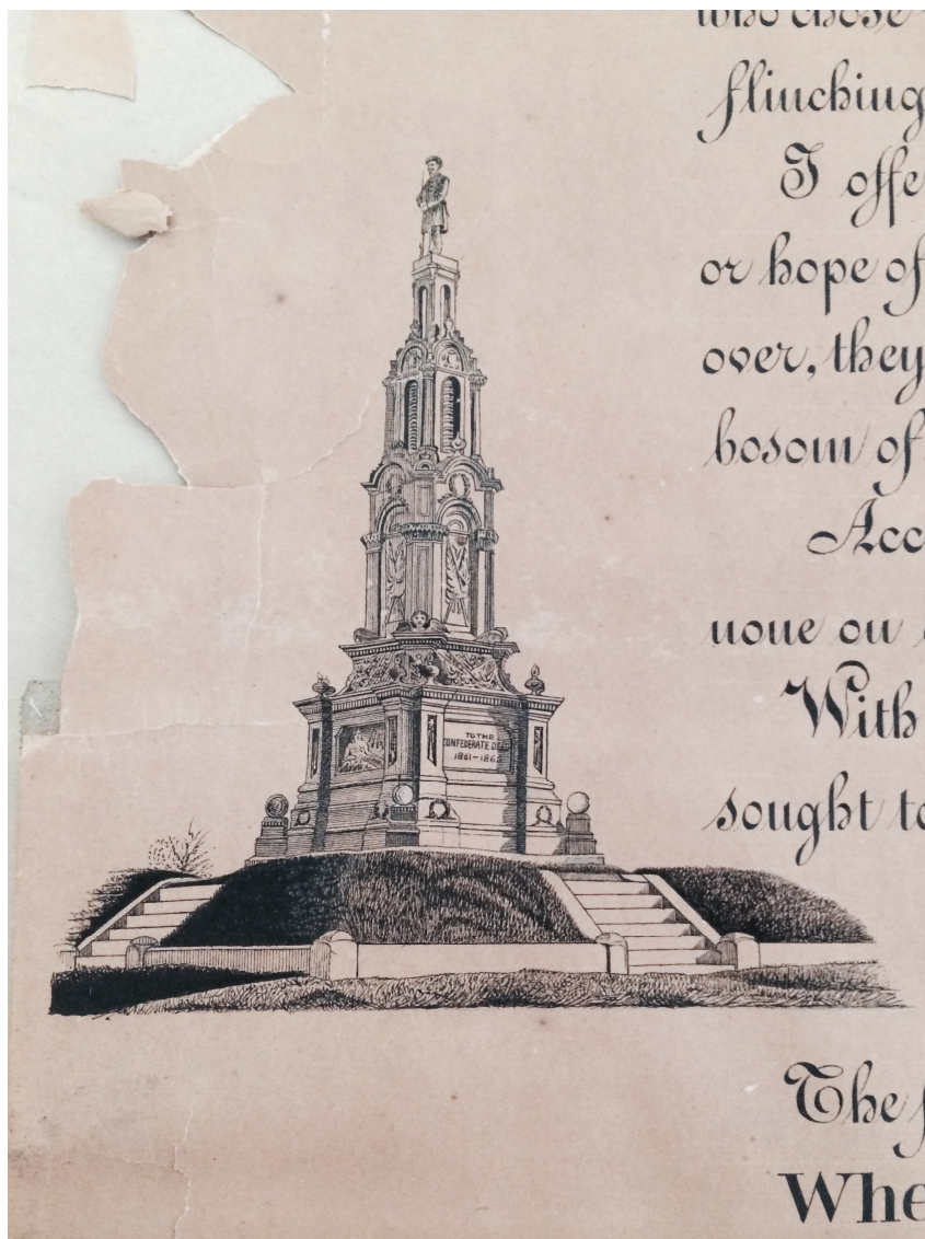
Figure 3: Drawing of Redesigned Monument in Savannah (Photo courtesy of author, located at Georgia Historical Society in Savannah, GA, Collection No. 2258.)

instead of vases, at the base of the monument would be more appropriate. 107 These debates demonstrate that even if the Savannah LMA conceded to the design changes, they were going to have the final say. Perhaps the Ladies were not satisfied with allowing men to make all the decisions and still wanted to have credit for assisting with the redesign.