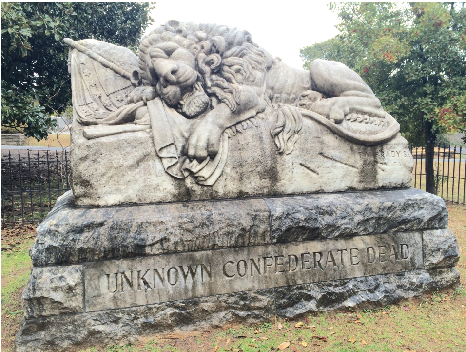
Figure 4: Lion of Atlanta