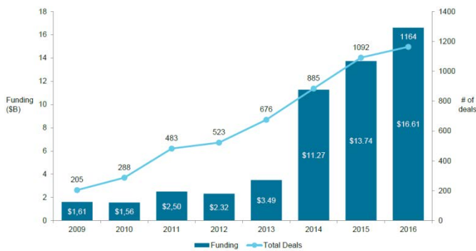
Figure 2 – FinTech investment dollars and deals (2009-2016)