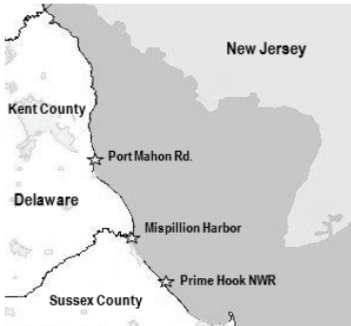
Figure 1. Delaware Bay Birding Sites

The spring shorebird migration takes place during the month of May and into early June. In order to capture visiting birders, we defined our sampling timeframe from May 1 to June 15, 2008. Our goal was to distribute a total of 600 surveys onsite. Respondents were asked to complete one survey per household at the end of the day and mail it back in the postage-paid return envelope. Sampling took place over the course of 11 days (4 of which were weekend days). Due to the low visitation rates per hour and the number of surveyors onsite, we were able to approach and distribute surveys to virtually all bird watchers during sampling. 3