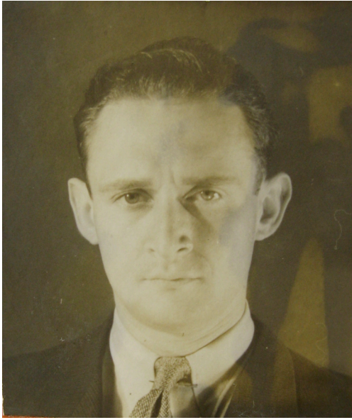
Maurice Bourgès-Maunoury, DMZ- Sud, HS 8/1001, BNA