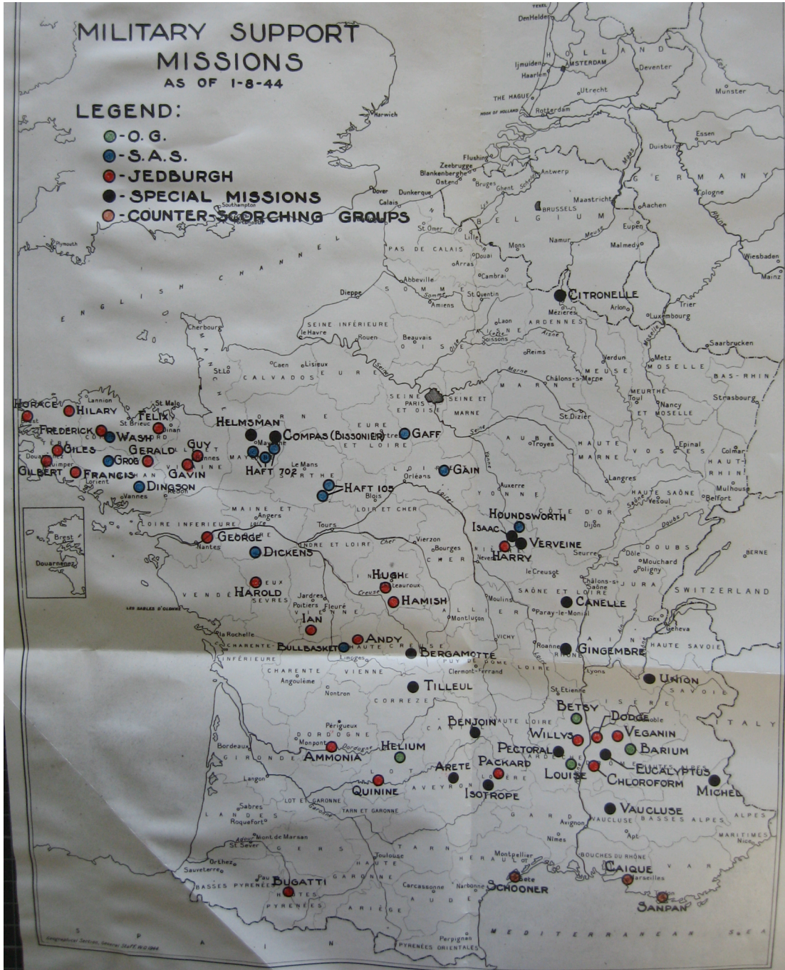
AIR 20/8011, BNA, Kew, UK.