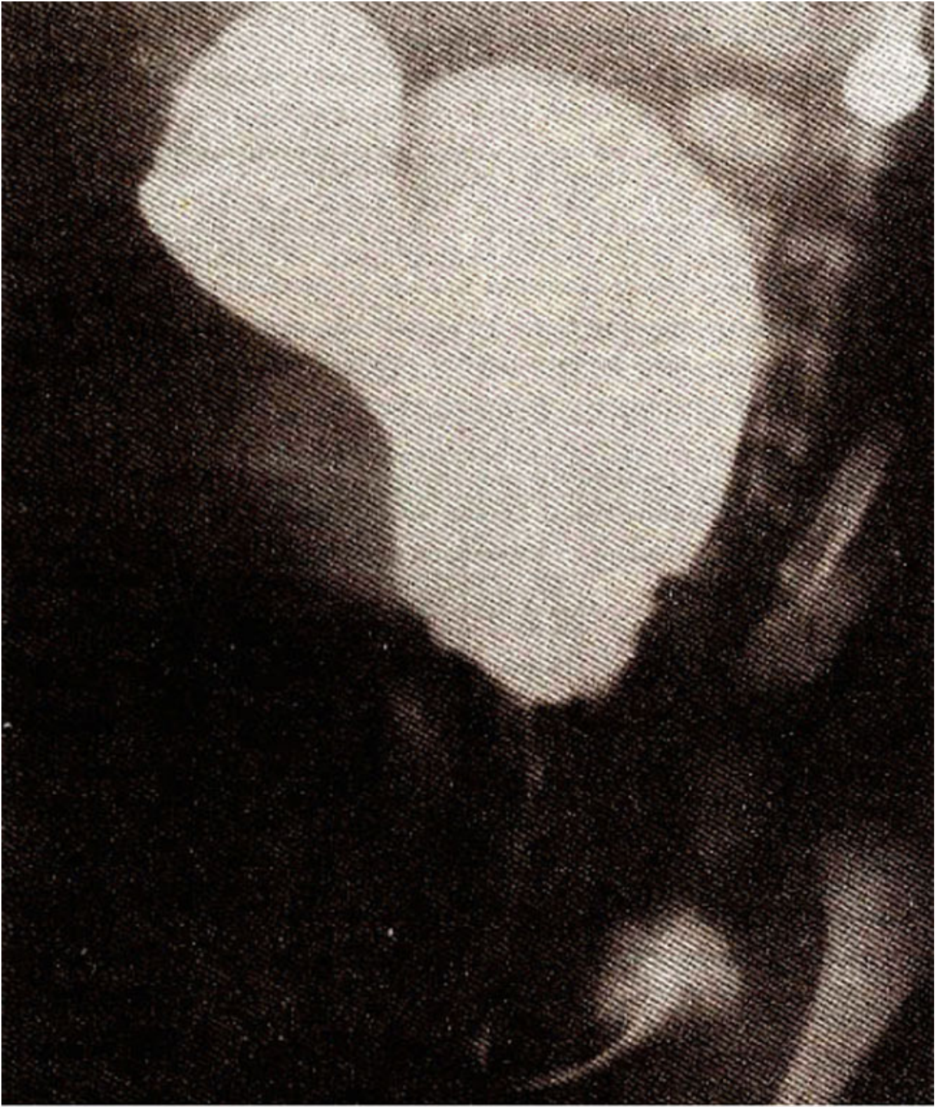
Figure 2. Sinogram

were not helpful in defining the internal anatomy clearly.