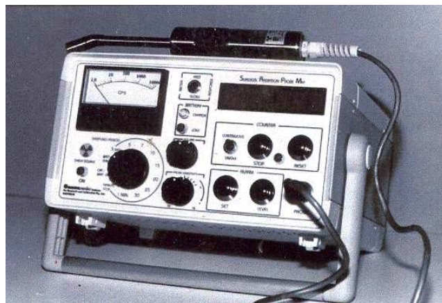
Figure 1. Gamma ray detecting probe.

After the primary tumor had been removed, the gamma probe (in a sterile glove) was used to precisely locate the skin projection of the node emitting the greatest radioactivity, using the skin mark as a guide. The skin was incised directly over this point and using the gamma probe to guide dissection. The node emitting the highest activity was placed in the container labeled as sentinel lymph node. This was followed by complete axillary dissection in 28 patients. In 4 patients simultaneous axillary dissection was not performed as these patients decided to defer it till