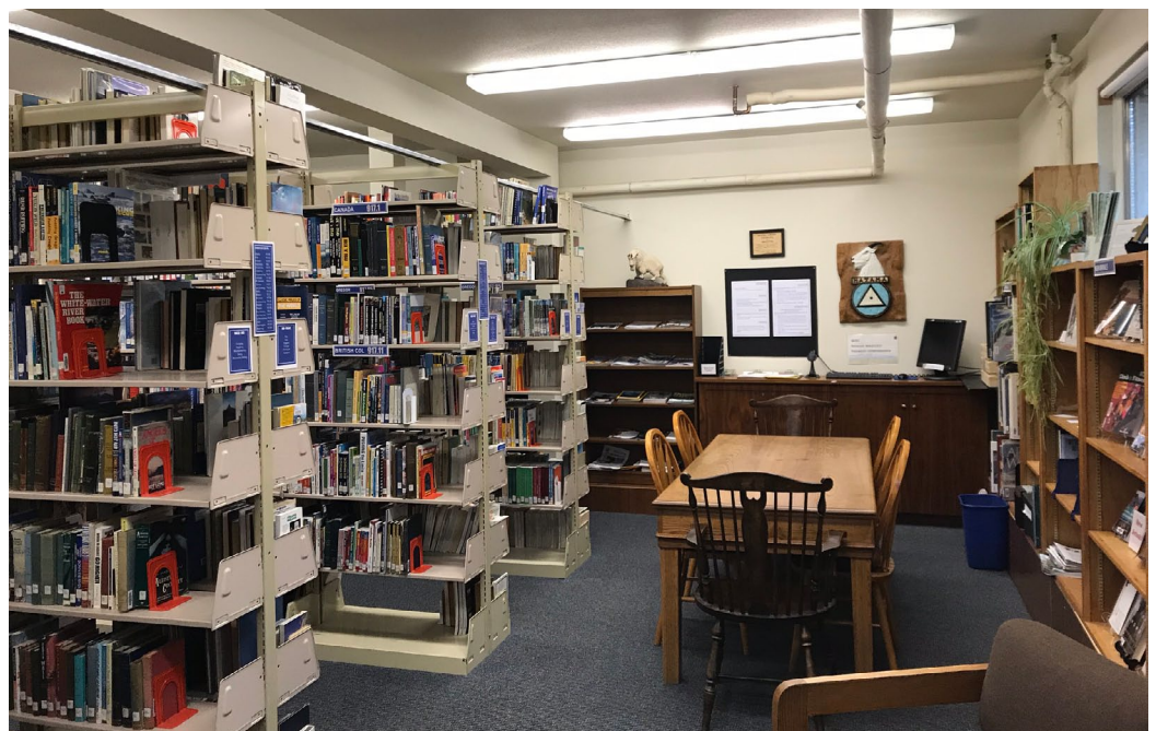
Mazama Library, Mazama Mountaineering Center, Portland, OR.

The Mazama Library, one-third of the Mazama Library and Historical Collections, is one of the few standalone mountaineering libraries operating in the United States today. Early photographs of the Mazama Clubrooms, as they were known then, reveal a small glass-fronted bookcase that showcased the first books in the Mazama Library. Over the next 102 years, the library acquired guidebooks, technical how-to titles, and rare books on mountaineering. Today, the library is significantly more extensive and strives to meet the varied needs of members, researchers, and the interested public.