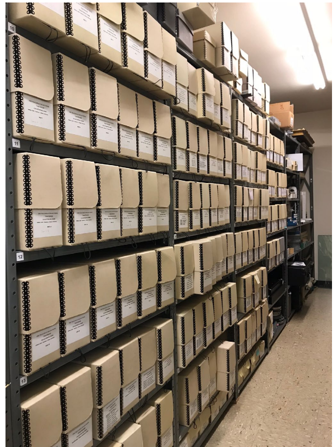
Mazama Library, Mazama Mountaineering Center, Portland, OR.