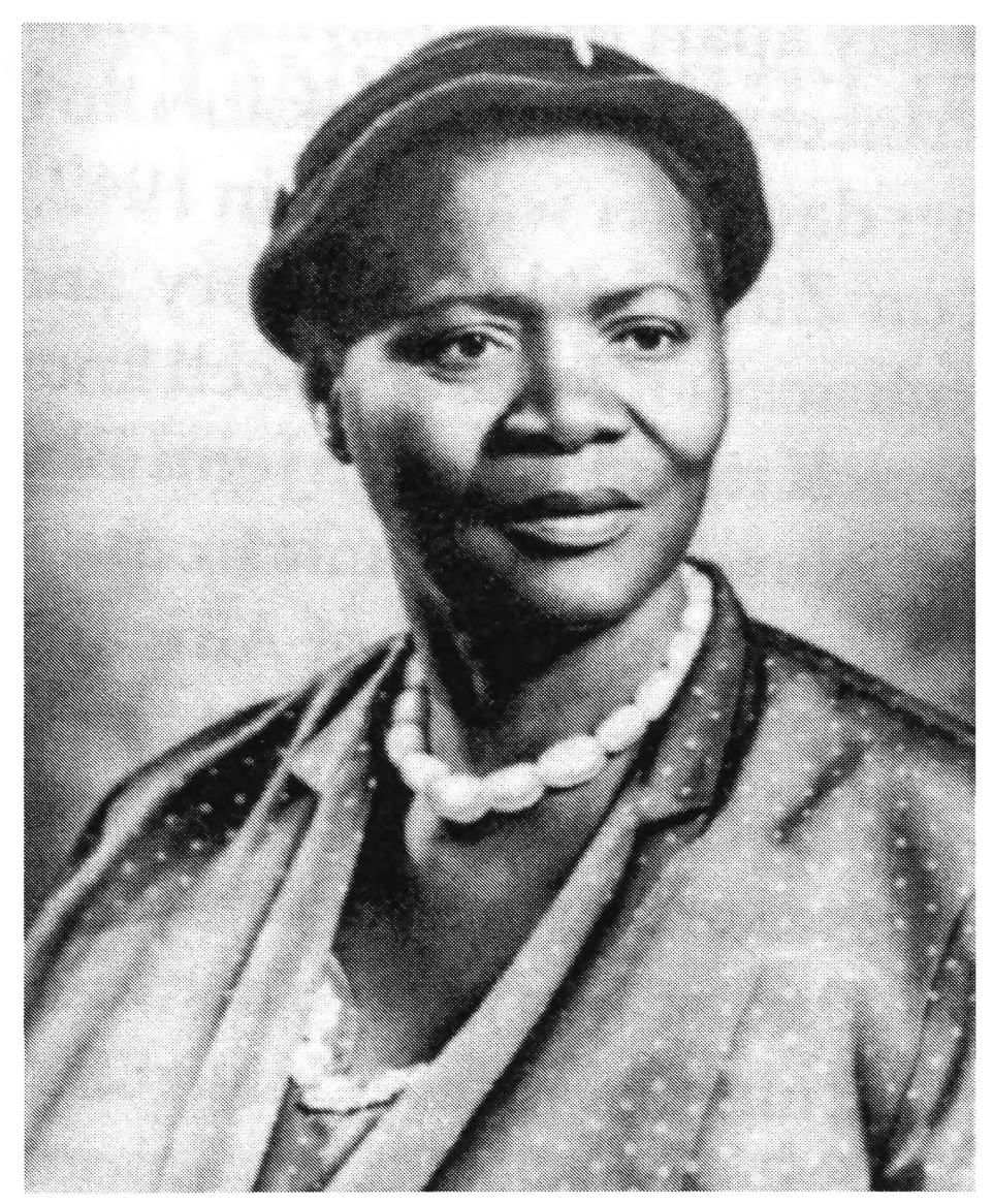
Photo of Princess Magogo kaDinuzulu in Petticoat Pioneers: Women of Distinction, comp. Ruth Gordon.

before the group set out on its 'world' tour. There may have been other reasons as well, for its popularity. It chose to highlight the popular musical form known as maskanda , thought to have grown from what was originally a women's form of solitary song (James 72) which allows modern troubadour figures to sing in a form that is recognisably contemporary and yet clearly draws on 'tradition'. Its practitioners, the most famous of whom was the male singer, Umfaz' Omnyama [Black Woman], whose early death from cancer in April 2001 occasioned a near