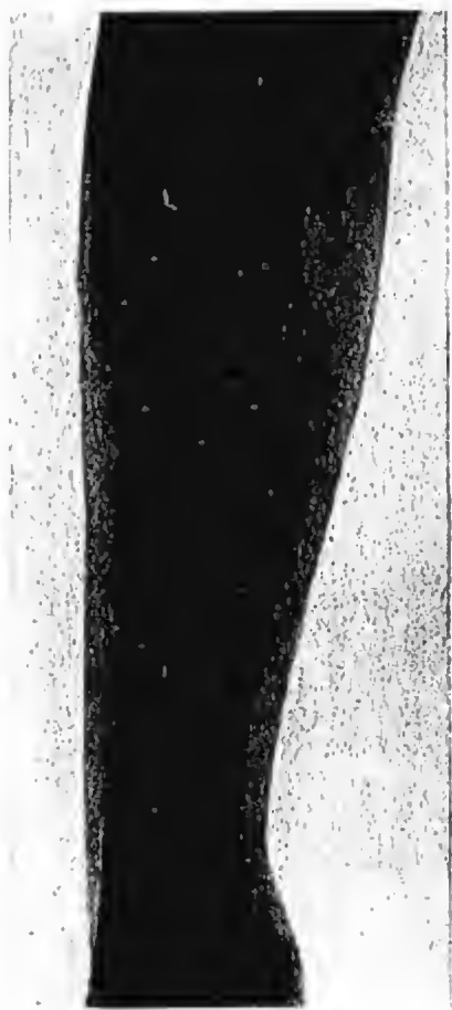
FIG. 3.—Radiogram showing condition thirteen months after operation.