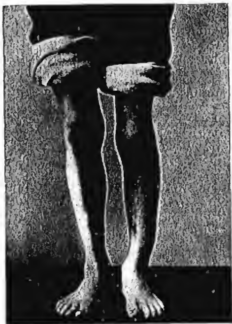
FIG. 4.—Condition on discharge.