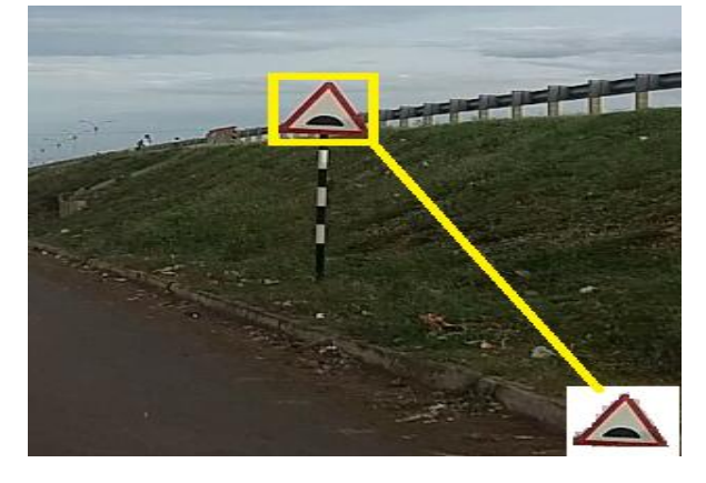
Fig.3. Road sign image acquisition for detection and recognition system

"Raspberry Pi" hardware is used for final execution. Jessie operating system is installed on Raspbian raspberry pi for processing. Raspbian is a Debian-based computer operating system for Raspberry Pi, it uses PIXEL, Pi Improved Xwindows Environment, Lightweight as its main desktop environment as of the latest update.