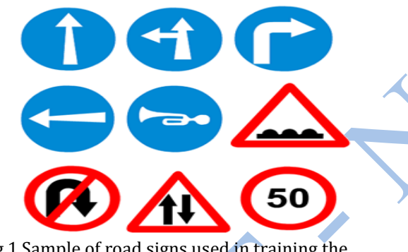
Fig.1.Sample of road signs used in training the proposedsystem

The proposed system consists of the following two main stages: detection and recognition. The complete set of road signs used in our training data and recognized by the system is shown in Fig.1.