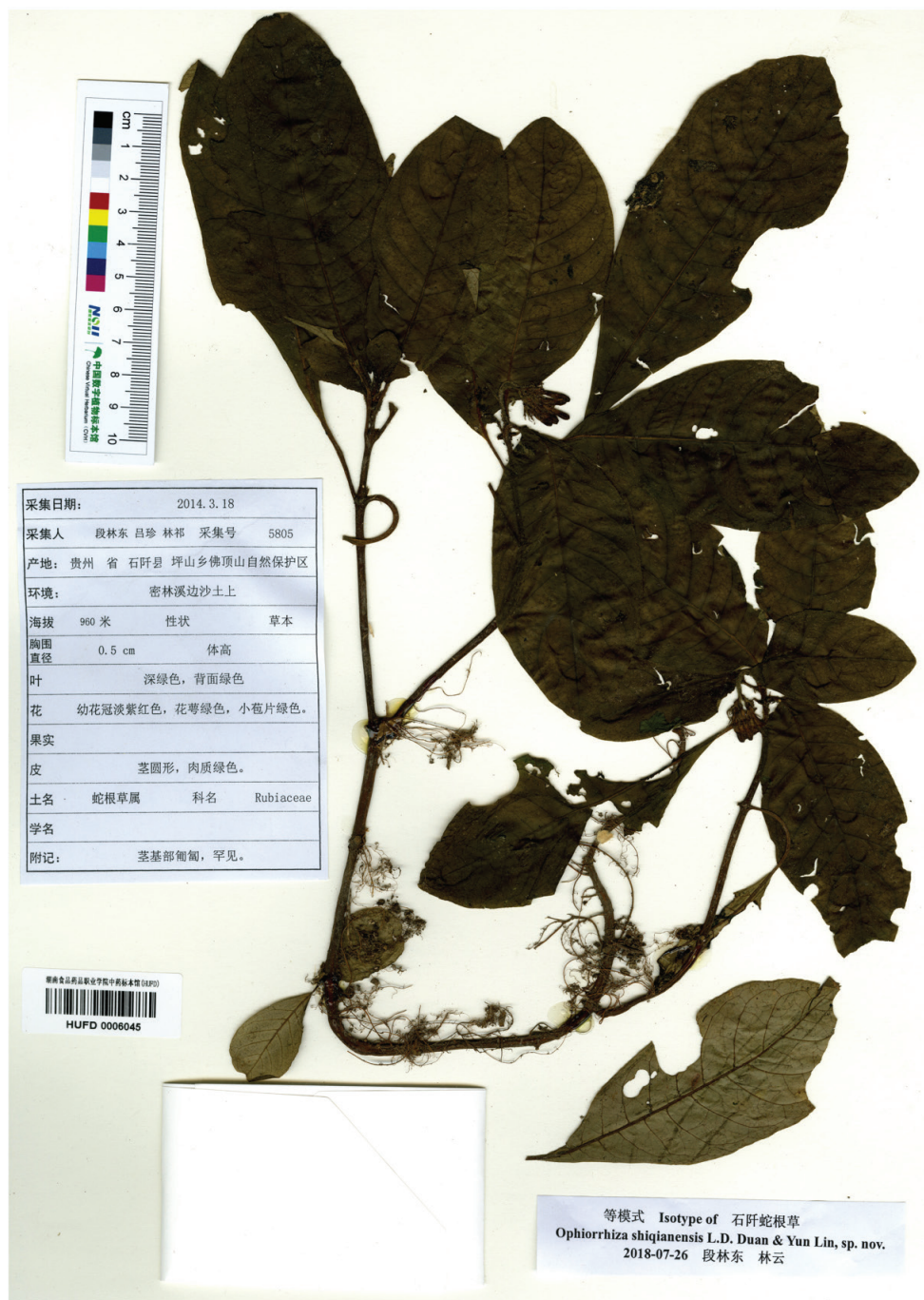
Figure 2. Ophiorrhiza shiqianensis . Isotype, showing subterranean stem internodes 5–10 cm long and inflorescences 2- to 10-flowered.