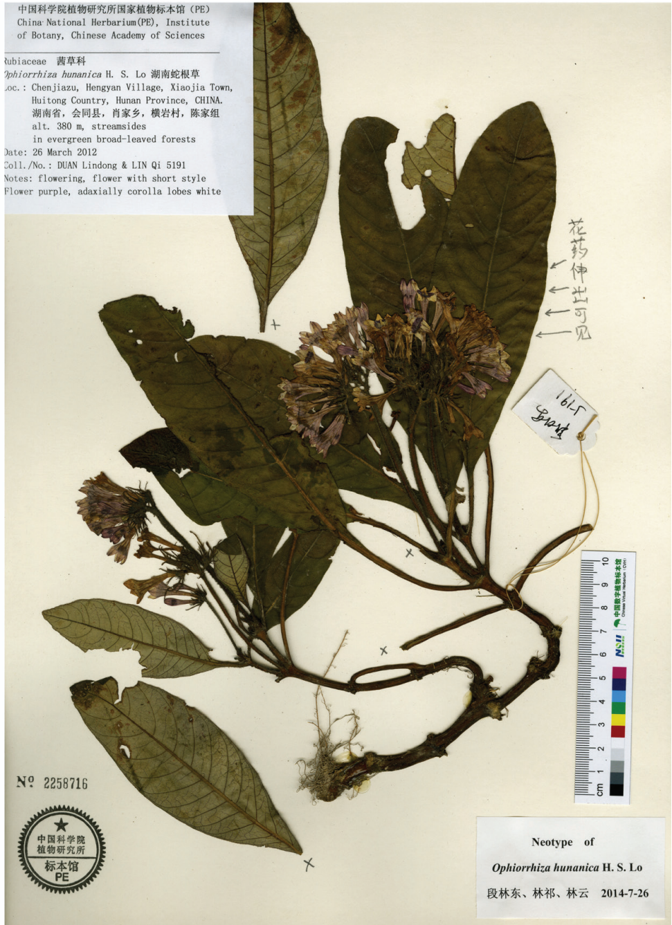
Figure 3. Ophiorrhiza hunanica . Neotype (designated by Duan et al. 2014), showing subterranean stem internodes 1–2 cm long and inflorescences 5- to many-flowered.