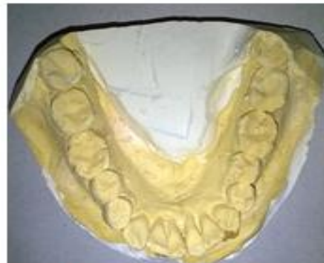
Fig 4 - Mandibular Master Cast