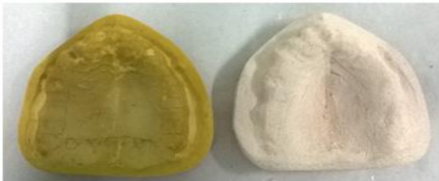
Fig 6 - Duplicated Master Cast