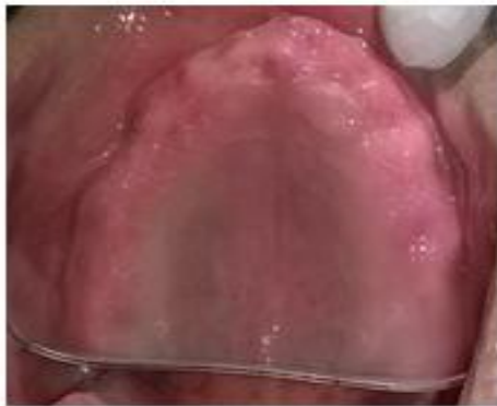
Fig 1 - Maxillary

Metal bases for complete dentures have been used successfully and provide many advantages over the more commonly used acrylic resin. The few disadvantages are far outweighed by the many advantages. The possibility of allergy to the metal, although a valid concern, varies with the composition and electrochemical properties of the alloy and the susceptibility of the patient. With metal bases in dentures, the patient benefits by having a more comfortable, better fitting and stronger prosthesis. The dentist benefits by reducing post insertion visits and providing rehabilitation that will better satisfy the patient.