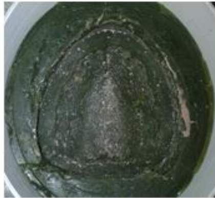
Fig 5 - Agar (Duplicating)