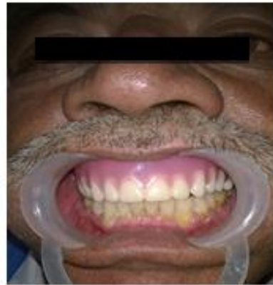
Fig 10 - Denture Insertion