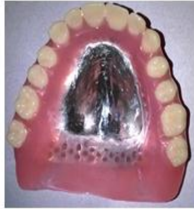
Fig 9 - Processed Maxillary Denture