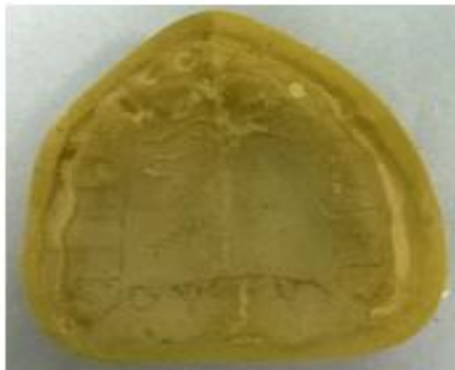
Fig 3 - Maxillary Master