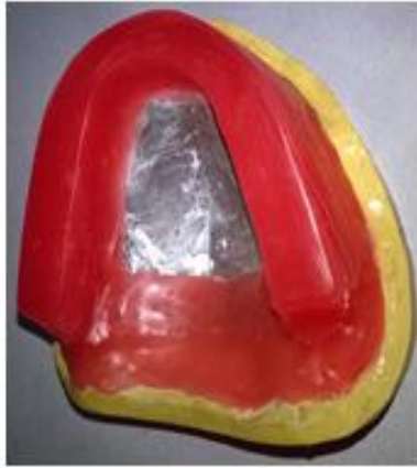
Fig 8 -Metal Denture Base with Occlusal Rim