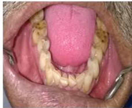
Fig 2 - Mandibular Arch