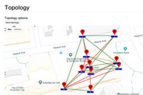
Fig 6.3 Network Scenario in OpenWSN

The Open Visualizer along with Open Sim consists of core modules and different types of user interfaces as follows[27]:Graphical user interface (GUI),command-line interface (CLI) and web interface.Python Language is used for interaction.It includes python modules for operation such as :open Visualizer Gui, moteProbe etc.To get started with the visualizer, point your browser to the URL: http://localhost:8080 . Simulation is event based so it is more realistic to analyze any scenario.RPL and CoAP protocols are analyzed with one very simple application.A small network is considered in the OpenWSN simulator,which includes 10 sender nodes and 1 sink node as a root. The network is shown in Fig 6.3.