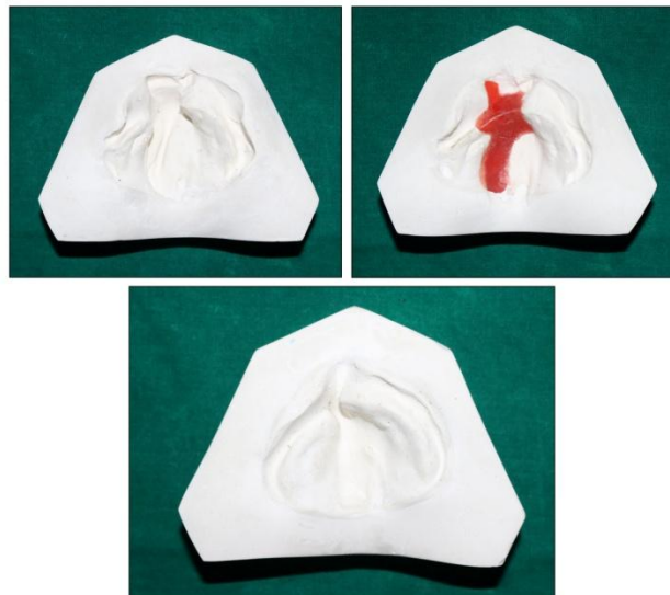
Figure 11: Pre NAM and Post NAM alveolar defect changes

PSIO-J hook appliance greatly improves the retention of molding plate along with reducing the bulkiness compared to the conventional plate. The reciprocal intraoral molding force against the alveolar segments during conventional nasal stent was eliminated by using J-hook modification appliance. The pre-surgical nasoalveolar molding assisted primary reconstruction using PSIO-J hook appliance results in an overall improvement in the esthetics of the nasolabial complex in cleft conditions while minimizing the extent of surgery and the overall number of surgical procedures. PSIO-J hook appliance, when used prior to primary surgical lip repair will produce greater positive effect in the esthetics, psychological and social arena.