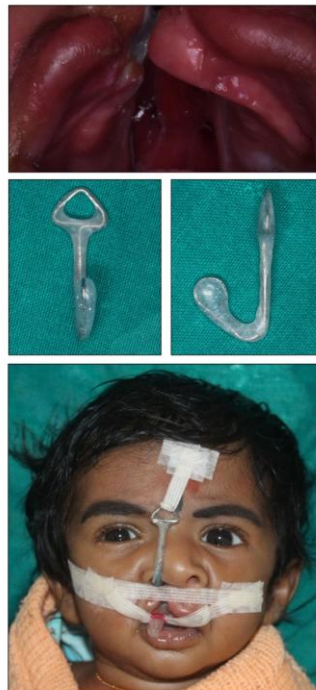
Figure 8: Fabrication and delivery of J-hook appliance

After 2 months, when the cleft gap has been reduced to approximately 5 mm unlike conventional nasal attachment stents a modification was given to enhance retention and to avoid bulkiness of the molding plate. The J hook appliance is a stent with a projection of acrylic supported by round stainless steel wire which was attached to the forehead [Figure 8]. Conventional nasal stent also exerts a reciprocal intraoral molding force against the alveolar segments hence this drawback was eliminated by using J-hook modification appliance. The J-hook nasal stent was inserted passively into the nostril and covered with a thin veneer of soft reliner to apply positive elastic pressure. The J-hook stent appliance was delivered and the phase of active nasal cartilage molding was started. This pressure aids to lift the collapsed nostril and in molding the nasal tissue.