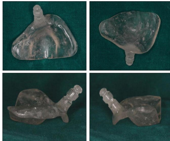
Figure 6: PSIO appliance

On the second appointment a well-finished and polished molding plate was inserted into the infant's mouth on the same day to promote feeding as that was one of the chief complaints of the infant's mother. Small red orthodontic elastics (0.25- inch diameter) were incorporated into the loops of thinner Steri- Strips that are folded over on themselves. The elastic band is placed over the retentive button, and the Steri-Strips were pulled and secured to the base tapes on the baby's cheeks [Figure 7]. Enough retentive force had been exerted when the elastics were pulled to twice their original length. The correct force vector on the retentive tapes and elastics were directed posteriorly and superiorly. The Steri-Strips and elastic bands were changed as and when necessary to allow continuous retention of the appliance. The base tapes remained in place for a longer period of time, while thin tapes required replacement several times.