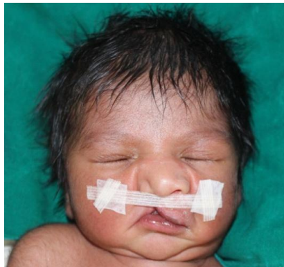
Figure 2: lip taping– 5 th day (first appointment)

On the first visit itself, lip taping was done using Steri-Strip (3M Steri-Strip™). A base tape was placed and a hydrocolloid type bandage was placed over the cheeks since it serves as a barrier between the retention tapes and the cheeks to minimize tissue irritation. Instructions were given to parents about lip taping and were advised to continue lip taping for a week [Figure 2].