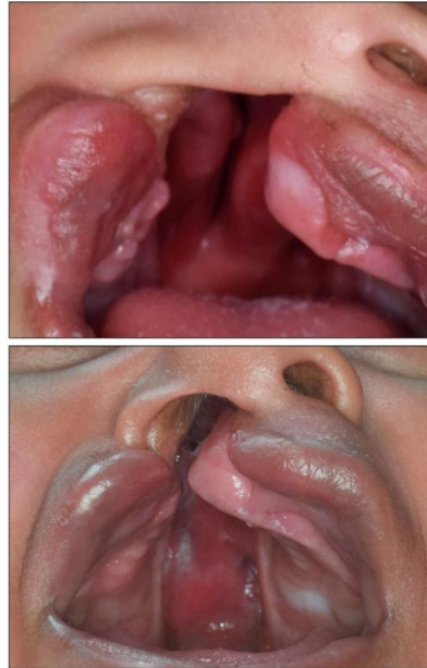
Figure 4: Pre and post orthopedic cleft alveolus intraoral photographs

which indicated that NAM plate improved feeding. At the end of NAM, there was reduction in the alveolar cleft from 14mm to 3 mm [Figure 11] and the columella was lengthened and repositioned from an oblique position into an upright position, which resulted in improved nasal alar cartilage symmetry [Figure 4,9]. At the end of 5 months when the infant weighed 8.5 kgs , the contour of the nostril on the cleft side resembled the unaffected side.