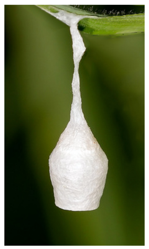
Figure 3. Spider sac of Agroeca sp. (Aranea: Liocranidae)