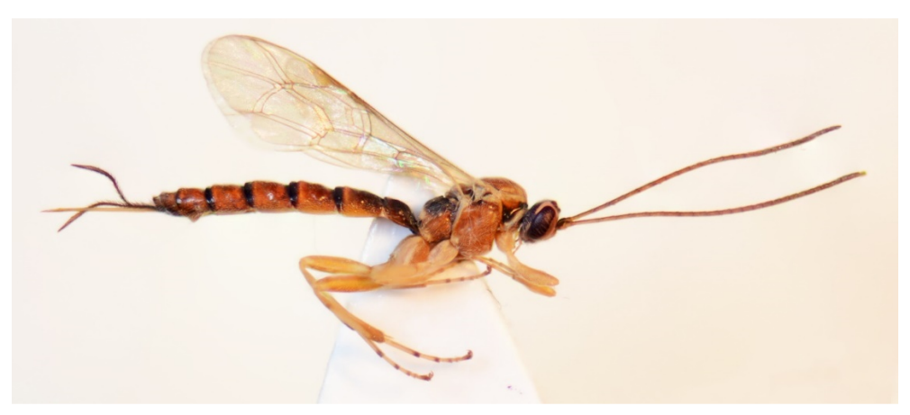
Figure 2. Female specimen of Bathythrix formosa (Desvignes, 1860)