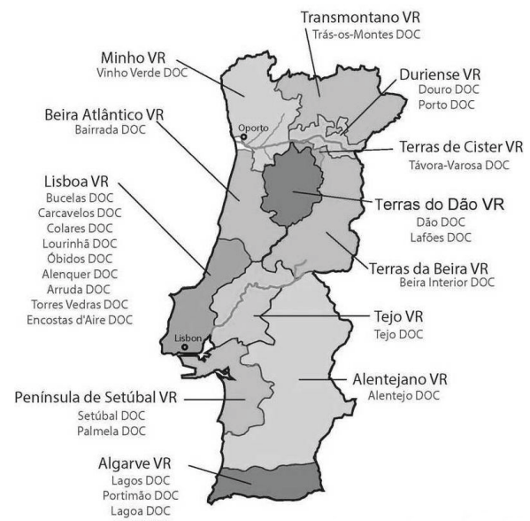
Figure 2. Major Wine regions and D.O.C.'s in continental Portugal

The Douro Valley is the oldest wine region in the world covered by the appeal D.O.C. It is situated 100 km from the Atlantic coast into the hinterland and stretches up to the border with Spain. The area of vineyards stretches in