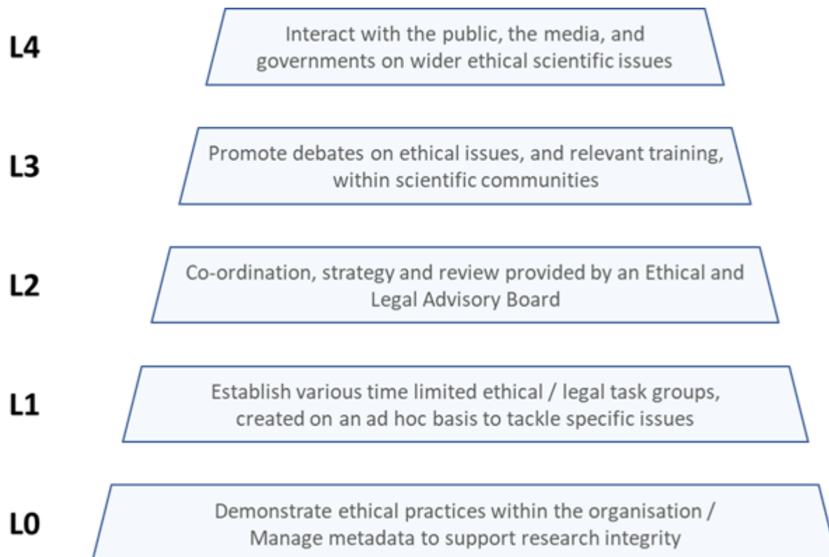
Figure 2 - A summary of the different levels of commitment to ethical (and legal) issues possible within EOsc

Establishing this group would also make an important public statement about the importance of ethical and legal considerations to EOsc.