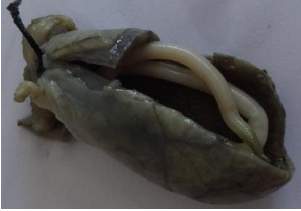
Figure 2. Ascaris lumbricoides in the lumen of gall bladder