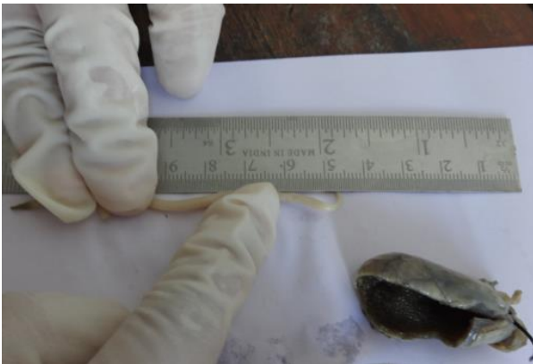
Figure 3. Length of worm is 8.0 cms.

Representative sections of the gall bladder were processed. Under light microscope, eosinophilic cholecystitis was reported (Figure 4 & 5).