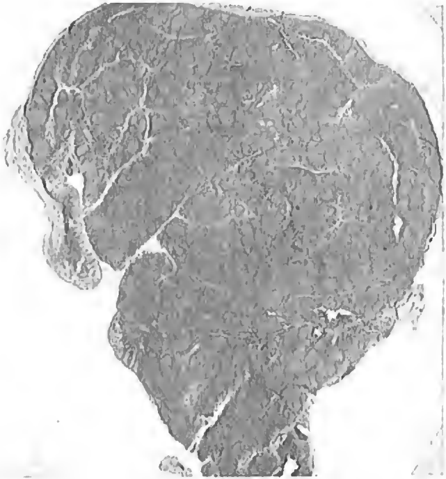
Section of a deeply buried tonsil. The flat surface is the one directed toward the mouth.