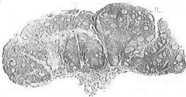
An elevated large and flat tonsil.