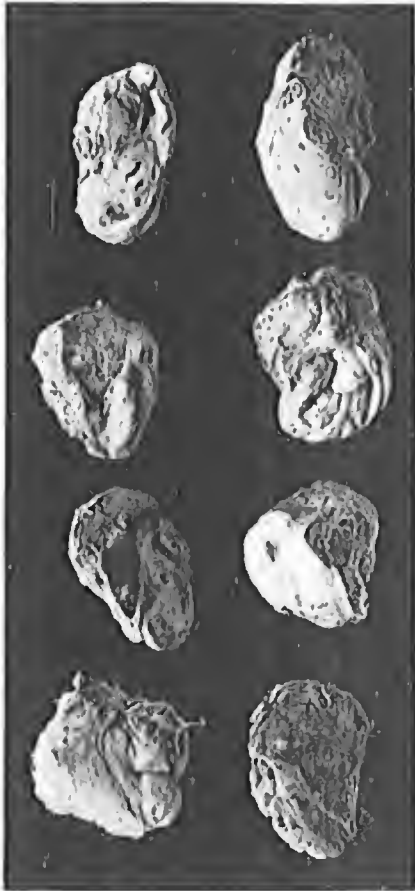
Deeply buried tonsils after enucleation.