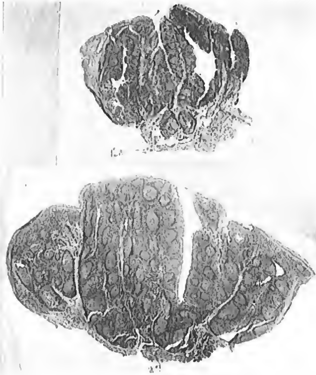
Small soft, ragged tonsil, with deep crypts, base deeply buried. Section of a large partially elevated tonsil, only partially removable by a tonsillotome.