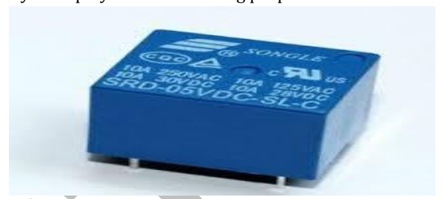
Photograph 4: Relay

A relay is one kind of switch that uses an electromagnet to maneuver the switch from the OFF to ON position rather than an individual moving the switch. It takes a comparatively less of power to run a relay, however the relay can manage something that pulls way more power. A relay is employed for controlling purpose.