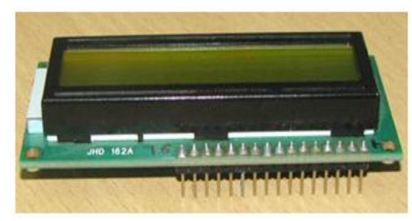
Photograph 2: LCD

A liquid crystal display (LCD) is interfaced to microcontroller that's accustomed display the meter reading, date, time etc. The 2x16 bit LCD interface card with supports each modes 4-bit and 8-bit interface, and additionally facility to regulate distinction through trim pot. Liquid crystals don't emit light directly. It's one sort of flat panel show.