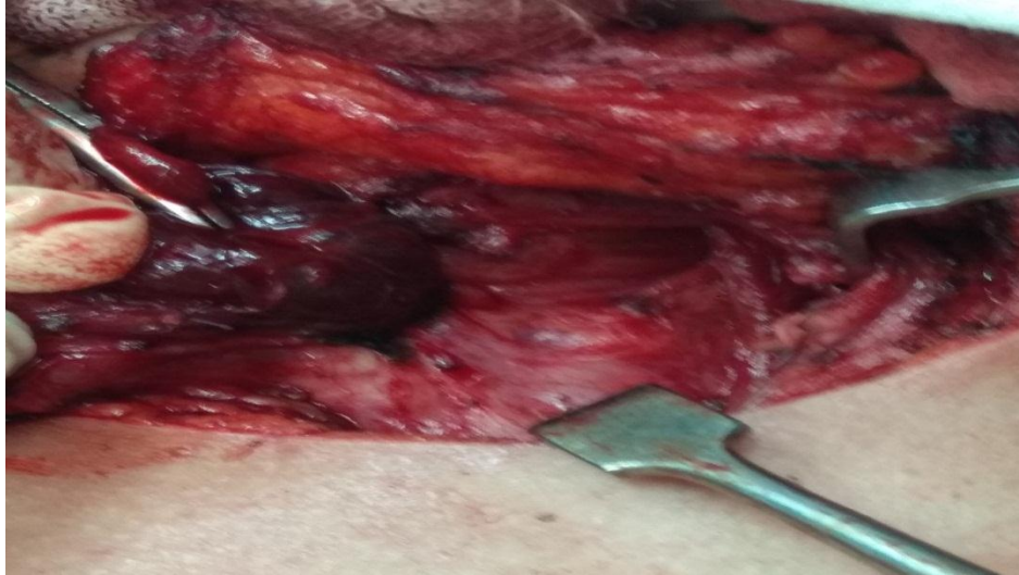
Fig 1:- show thyroid field before MB spraying with no visualization of RLN.