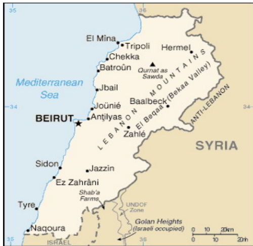
Figure 1: Map of Lebanon