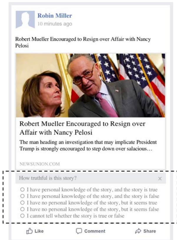
Figure 1: An example of a news headline (with the user-rating treatment in the dotted box)

The headlines and images were designed to avoid major differences in the type and magnitude of feelings they would generate. We used a gender-neutral name for the person posting—not to be confused with the original source who authored the article—and the comment from the person posting was a summary of the headline itself. To minimize any news source specific effect (e.g., some