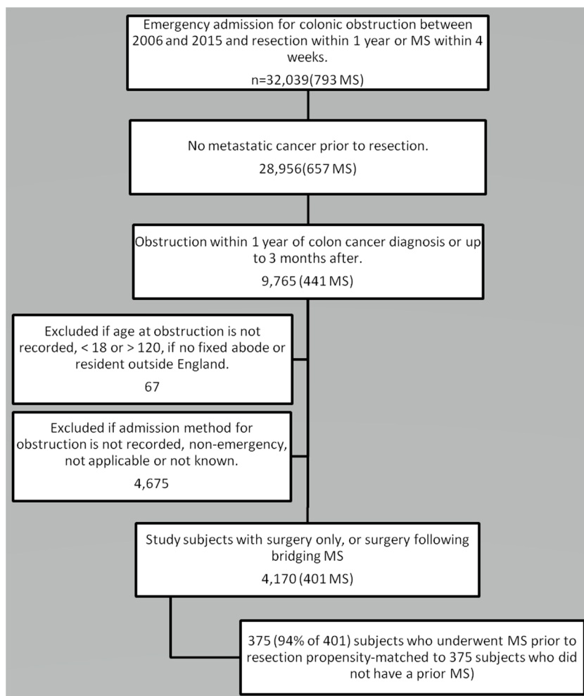
Fig. 1 Study flow chart