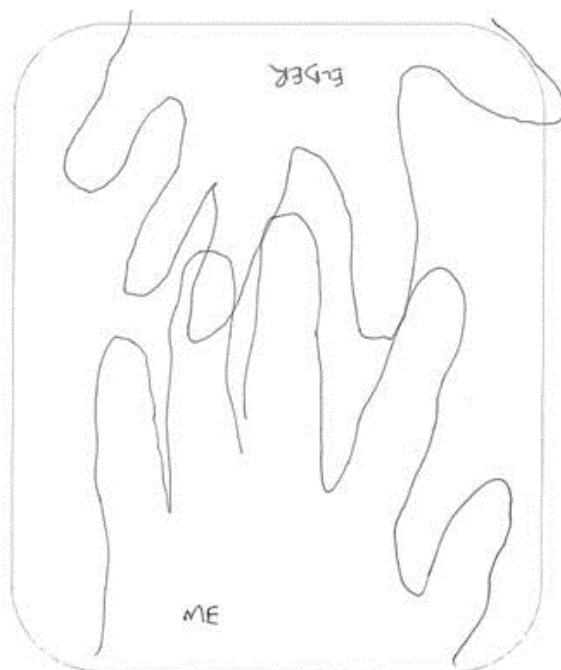
Figure 2. Reflective activity, service managers drawing of his own and an Elder's hand

When participants were asked to reflect on their engagement with the project and the experience of working together, one of the senior managers chose to trace his own hand and an Elder's hand (Figure 2). This, we believe, creatively speaks to the power of relationships and the engagement approach employed. By investing in this engagement phase, service providers are encouraged to look at systems change through a lens of trust, relationships and a Nyoongar worldview.