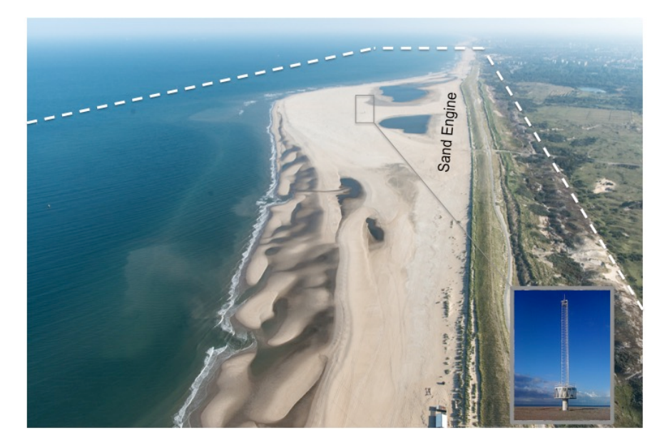
Fig. 1. Aerial photo of the proposed ICON.NL location. The Sand Engine is the region of anomalously wide beach while the adjacent Kijkduin beach segment is the straight beach to the north. The tall tower visible in the centre of the Sand Engine is the location of several of the proposed remote sensing instruments. Note the large spatial variation in waves and beaches in the location of interest.

To have scientific value, ICON.NL will deliver a one-of-a-kind data corpus featuring direct measures of the core environmental variables including waves, currents, bathymetry, terrestrial sediment transport, beach topography and ecology, as well as mapped variables created by competent numerical models coupled to observations using accepted data assimilation principles. The facility will operate not in short-experiment modes but continually, thereby sampling the full range of storm-to-calm conditions and availing ourselves to all opportunities provided by natural coastal dynamics. Against these ambitious needs, we must balance the logistical and financial costs of extended sampling.