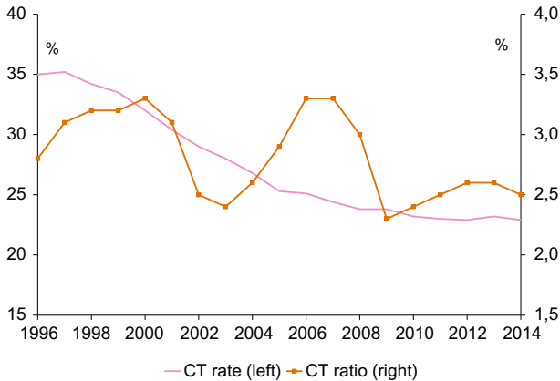
Fig. 1 European Union: trends in corporation tax rates and ratios 1995–2014. Source: European Commission (2016b). Calculations are based on simple arithmetic averages

should be calculated on an accretion basis, 11 in practice taxable profits are determined on the basis of International Financial Reporting Standards (IFRS), which is the European-wide rule since 2005 for corporations listed on EU stock exchanges. The accounting principles prescribe that revenues and costs should be matched on an annual basis under the accrual system of accounting. The costs of raw materials, intermediate products and wages, as well as expenses, including interest, are deductible if incurred in earning taxable profits and in maintaining the assets used in the corporation's activities. Potential losses are taken into account in computing taxable profits, but accrued capital gains are not taxed until they are realized.