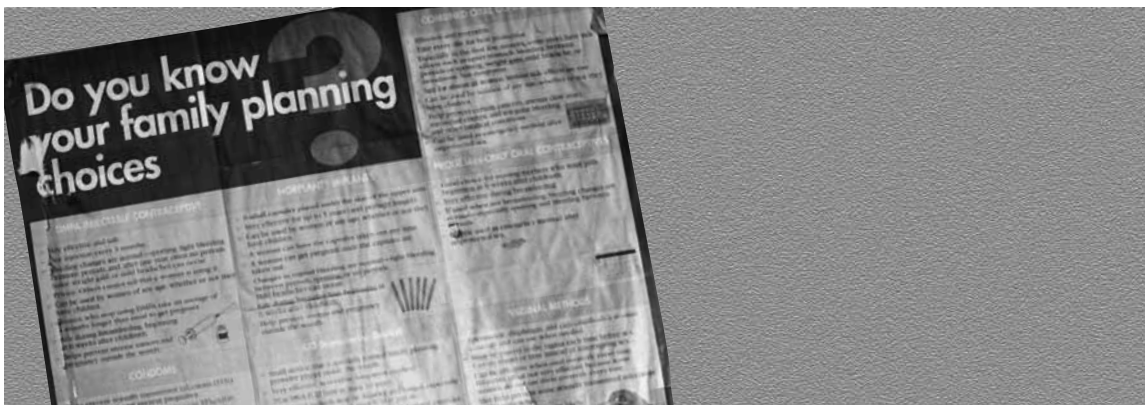
A damaged copy of the Do You Know Your Family Planning Choices? wallchart hangs outside a clinic in Kenya