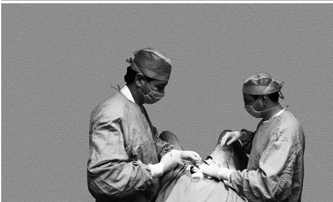
Surgeons at a Tijuana clinic perform a new tubal ligation procedure. The 20 minute procedure is done under a local anaesthetic, allowing the patient to stay alert and walk out of the clinic shortly afterward. Currently in Mexico, the procedure is only performed in Tijuana.

States have a responsibility to create an environment in which healthcare providers can most effectively contribute towards the realisation of sexual and reproductive health rights. For example, they should ensure healthcare providers receive training on human rights. This is vital if healthcare providers are to promote sexual and reproductive health rights in their work.