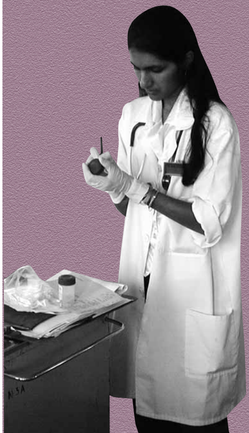
Photograph © 2005 Marilyn Keegan/COHSASA, courtesy of Photoshare. A medical intern checks medications at a hospital in South Africa.

This publication has been produced with the assistance of the European Union. The contents of this publication are the sole responsibility of the University of Essex and can in no way be taken to reflect the views of the European Union.