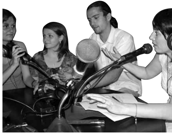
Young people producing a weekly radio programme that educates its audience about reproductive health issues, including HIV and AIDS, broadcasting from Chisinau, Moldova.

does not limit access to essential information on sexual and reproductive health, necessary for individuals to take control of their own sexuality and related sexual health; access legal abortion; and understand procedures for referral. 24