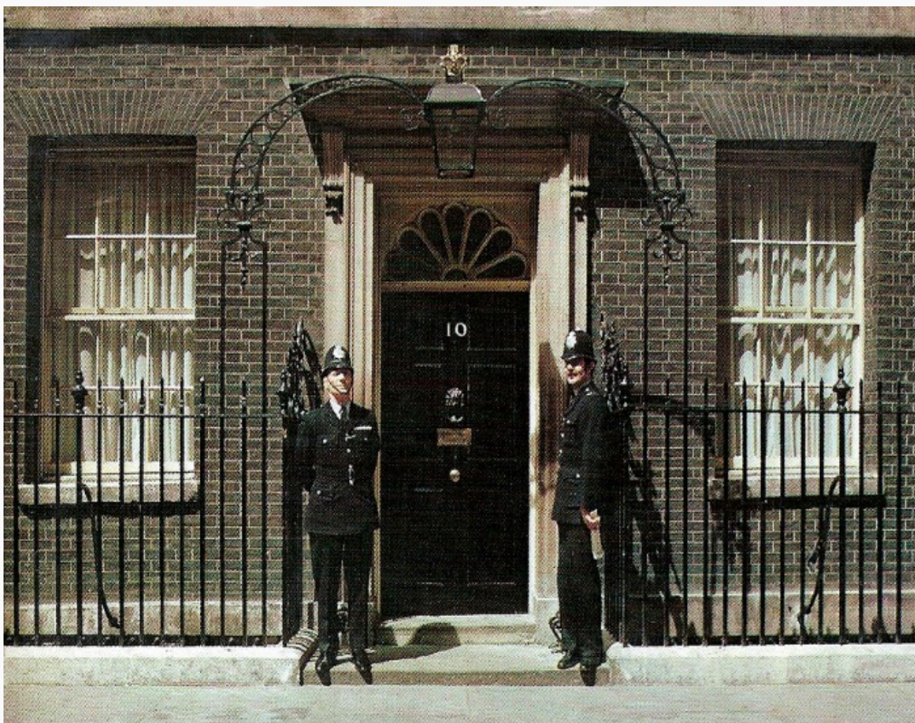
No.10 Downing Street.