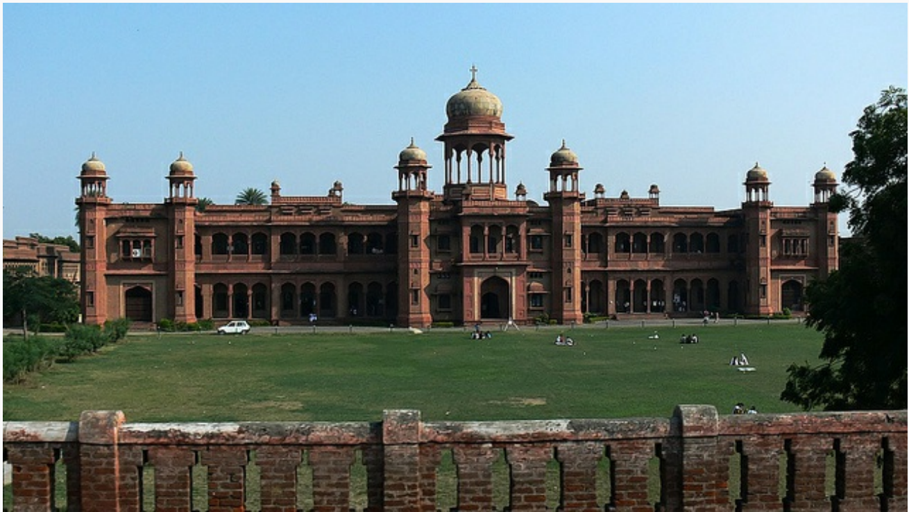
St. John's College Agra, India.

chapter in this section starts with a discussion around the First World War and ends with a discussion of the Second World War when many Indian nationalists collaborated with the Nazi Germany, motivated in part by the “politics of opportunism” and the momentum from decades of anticolonial movements (p.108).