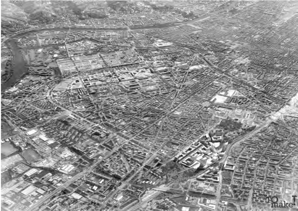
Fig. 2. ToMake Group, Bird's Eye view of the Masterplan for the Variante 200, Torino 2014