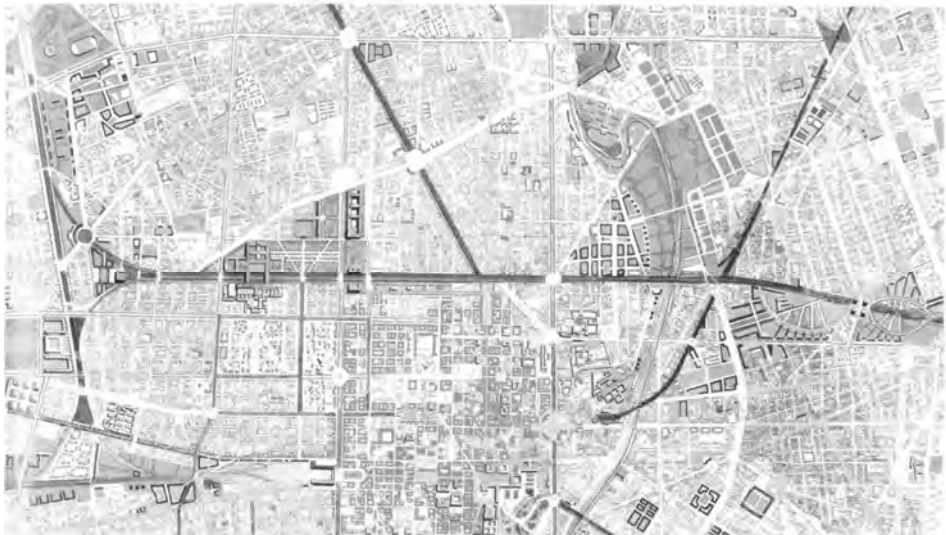
Fig. 1: Gregotti & Associati, Drawing of the Central Backbone of Turin, Masterplan for the PRGC of Turin, 1995

Yaneva, A. (2012). Mapping controversies in Architecture . London: Ashgate.