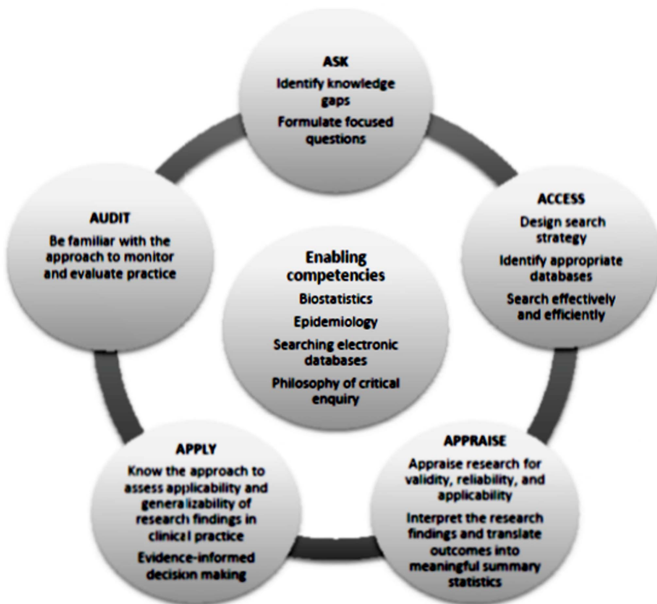
Figure 1. EBHC competencies. doi:10.1371/journal.pone.0086706.g001

of the records retrieved by the electronic searches were screened independently for relevance, based on the participant characteristics, interventions, and study design. Full text articles were obtained of all selected abstracts, as well as those where there was disagreement with respect to eligibility, to determine final selection. Differences in opinion were resolved by discussion.