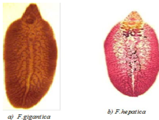
Fig. 1: Adult stages of Fasciola spp. Source: [4].

Morphology- Fasciola hepatica is a leaf shaped, fluke with broad and cone shaped anterior projection. It is grayish brown in color changing to gray when preserved. The tegument is armed with sharp spines. The young fluke at the time of entry in to the liver is 1-2 millimeter (mm) in length and lancet like when it has become fully mature in the bile ducts. It is leaf-shaped gray brown in color and is around 3.5cm in length and 1cm in width [3]. The eggs of F. hepatica are oval in shape, brownish or yellowish brown in color. The eggs have an indistinct operculum and develop only after the eggs have been