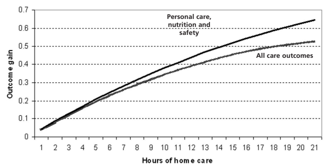
Figure 2: Outcome gains from home care services

Selecting the threshold to equalise costs of values across policy votes. It would strengthen the basis for allocations across policy areas competing for a share of the same budget to be able to compare the benefit/cost ratios for each area’s marginal expenditures. The invention of the ADLAY does this. The QALY, an analogous generic indicator for health outcomes is widely applied. Most famously, it is used by NICE, the National Institute for Clinical Excellence, in the evaluation of new pharmaceuticals and treatments. WR set the threshold maximum cost per ADLAY at £20 thousand. The Chair of NICE recently commented that ‘anything around about £20,000 per QALY is likely to be regarded as cost-effective. Beyond about £30,000 per QALY, we wouldn’t necessarily say ‘no’, but you’ve got to have