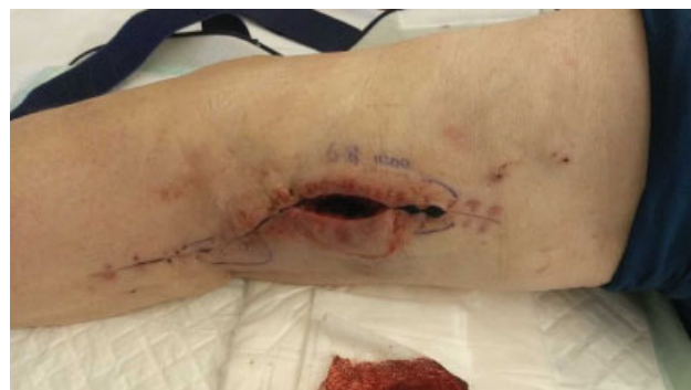
Fig. 2 Photograph after opening and cleaning the infected left popliteal aneurysm. Delayed wound healing can be seen and central wound separation after staple removal. Secondary wound healing was later seen at the outpatient clinic.

Oral ciprofloxacin was switched to intravenous meropenem for wider pathogen coverage at admission. Puncture of the left PAA was done 8 days after admission. Culture of the aspirated material revealed Listeria monocytogenes only intermediately sensitive to meropenem, but sensitive for amoxicillin and cotrimoxazole, after which the antibiotic regimen was changed to this combination. After this switch, the fever subsided. The left PAA sac was opened surgically and cleaned ( \rightarrow Fig. 2). Amoxicillin was administered for 4