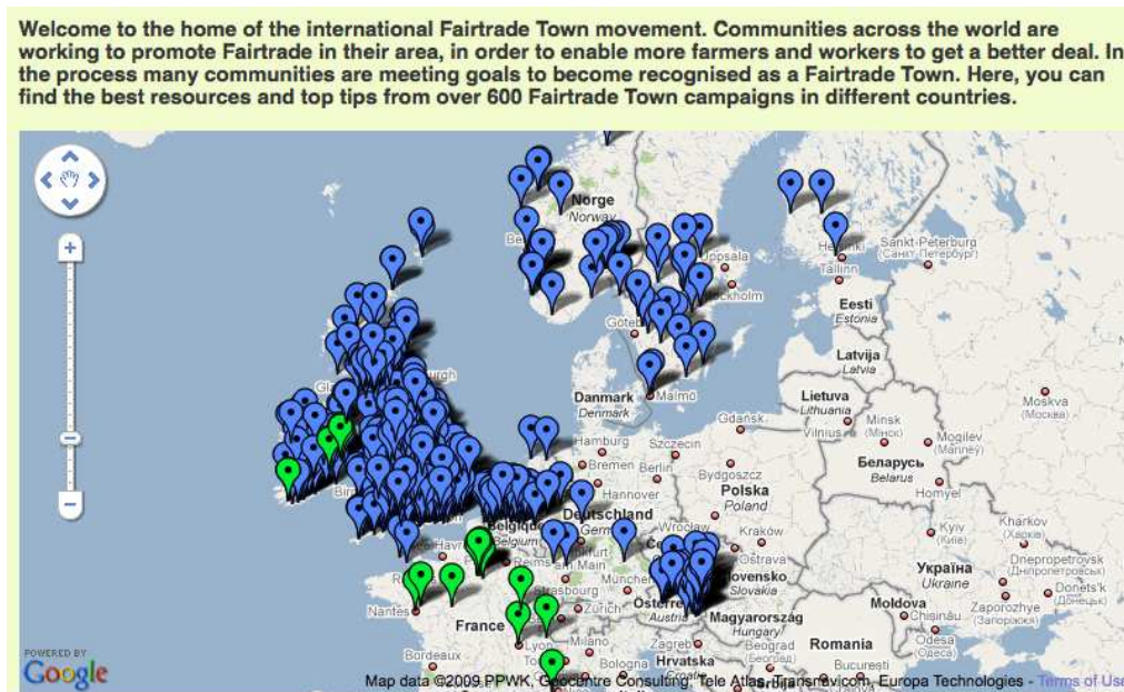
Figure 2: Locations of Fair Trade Towns in Europe in 2009