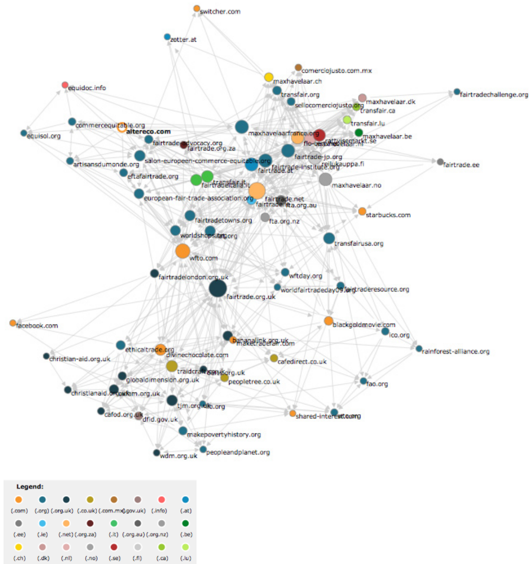
Figure 1: EU Fair Trade Network – Core Organizations

Nodes sizes reflect relative numbers of in- and outlinks per site. Crawl reach set to two iterations (two outlinks from starting points) based on outlinks found three pages deep in the sites. Organization domains are indicated by colors in legend.