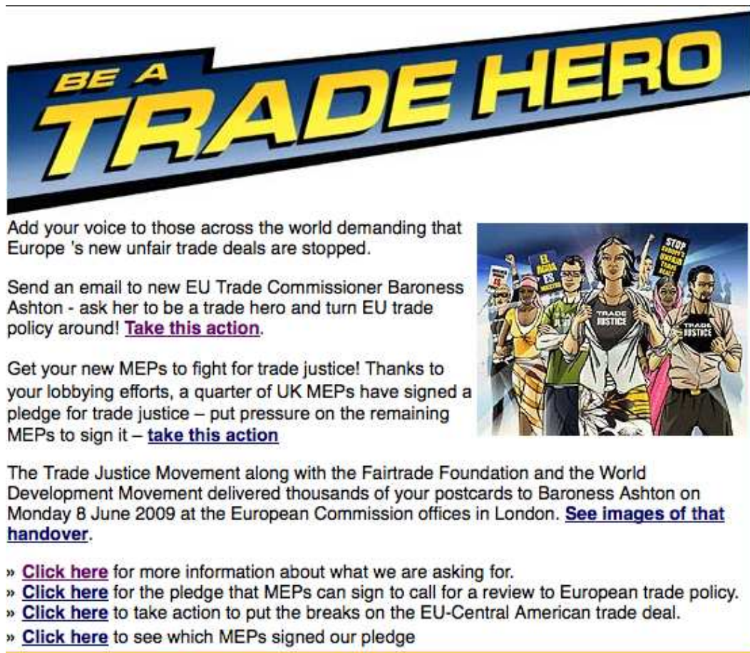
Figure 5: Example of direct citizen engagement opportunities with the EU from the 2009 Trade Justice Movement campaign enabling citizens to contact the EU Trade Commissioner and MEPs