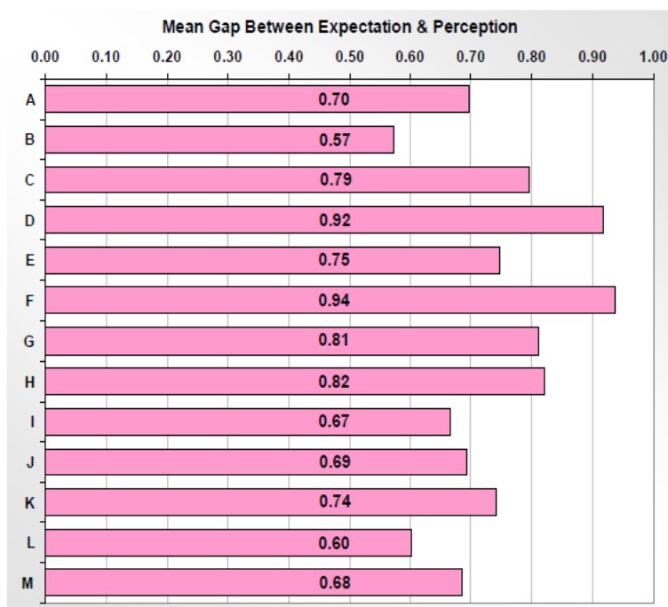
Figure 1.1: Mean gap between expectation and perception of industries