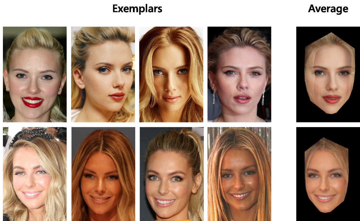
Figure 1. Exemplar and average images for a familiar (top row) and unfamiliar (bottom row) person. See image attributions in the Acknowledgements section.

morphed using custom MATLAB software (InterFace - Kramer, Jenkins, & Burton, 2016). See Figure 1 for exemplar and average image examples.