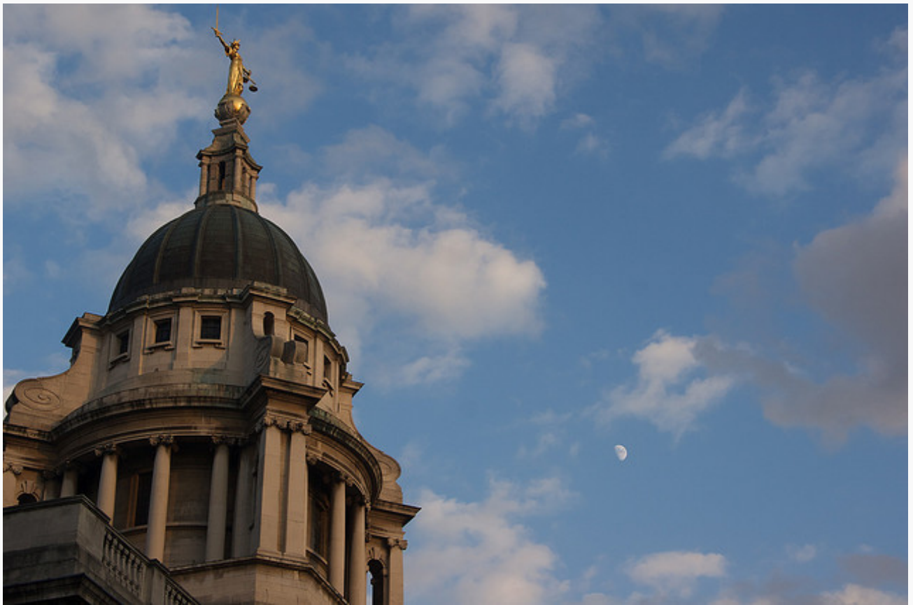
The Old Bailey, London.