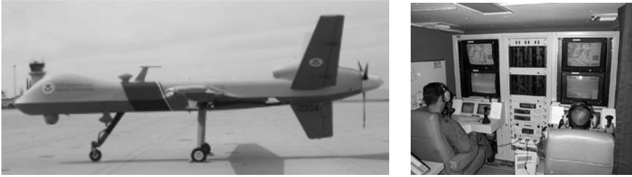
Figure 1: DHS Predator B (left) and inside view of GCS (right) [3]

Accident Events. The mishap flight terminated at 0350 Mountain Standard Time on April 26, 2005. This Predator B UAS was operated by General Atomics Aeronautical Systems, Inc. (GA-ASI), the Predator manufacturer. The GCS was located at Libby Army Airfield, and per standard procedure was operated by two people. The pilot was a GA-ASI employee and a CBP agent managed the camera controls. Two additional GA-ASI employees, an avionics technician and a sensor operator, were also in the GCS for the mission. After a short delay in takeoff due to an inability to establish a link between the Predator and PPO-1, the mission was launched successfully [3].