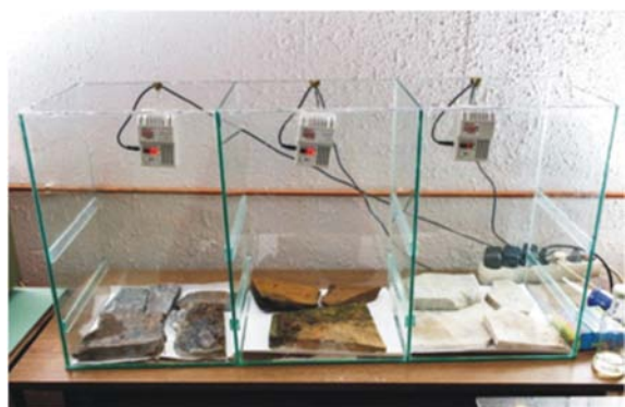
Figure 3. Chamber assembly for radon exhalation measurements

from the environment. Samples, from which radon gas emanates freely, are located at the bottom of each compartment.