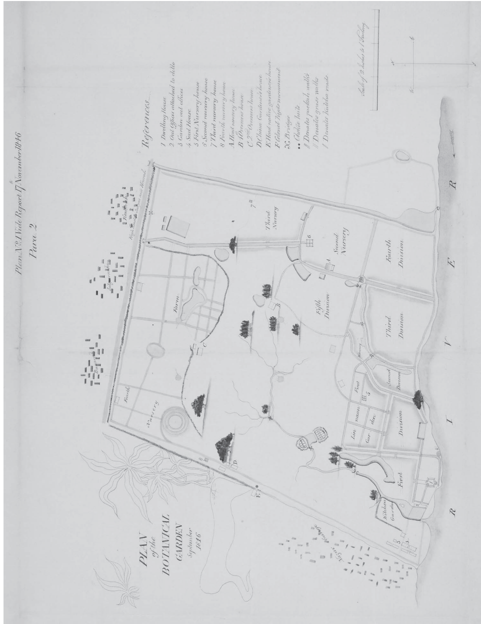
Figure 1. Plan of the Botanic Garden, September 1816.