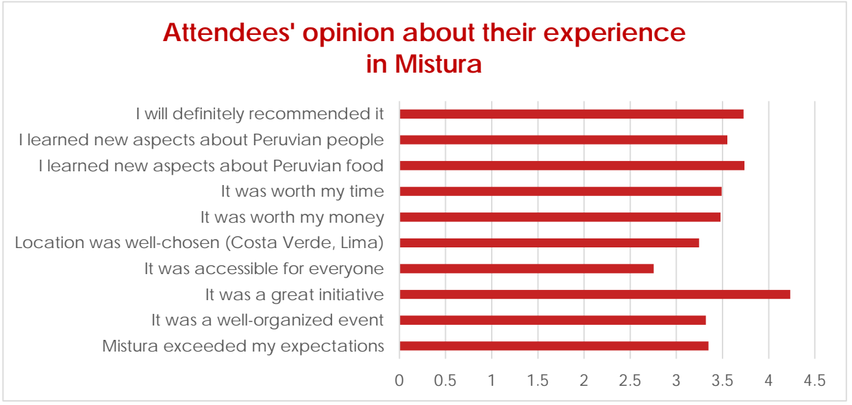
Graph 2: Proportions of agreement/disagreement based on the following statements.

= Strongly disagree, 2 = Disagree, 3 = Neutral, 4 = Agree, 5 = Strongly Agree)