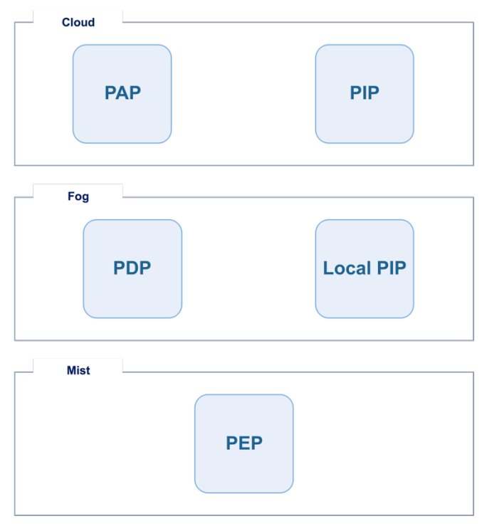
Fig. 2. Components placement

In the IoT reference by ITU [29], edge devices can communicate either directly with the upper layers or through a gateway node. Regarding PEP deployment, it can be either integrated with the device or with the gateway. Integrating PEP in a gateway enables support for joining proprietary or other devices that cannot be natively controlled. Moreover, access control in the industrial environment can heavily rely on mist implementation directly into the edge network fabric [14], thus potentially eliminating any latency or connectivity issues. An indicative component placement is presented in Figure 2.