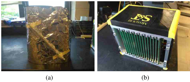
Fig. 1. Elements of the setup: (a) object under test, and (b) microwave camera from [7].

Imaging results for incremental partial views, according to the update equation given in (1), are shown in Fig. 3. As additional views are added to the image data progressively (Figs. 3 (a)-(f) corresponding to 1-6 views) the geometry of the target, including the bar, becomes more evident.