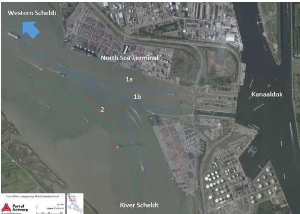
Figure 1 : Port Of Antwerp ; Location North Sea Terminal; Three examples of passing trajectories (blue) and edge of navigational channel (green dash).

In order to accurately model the behaviour of moored vessels, the software tool which is used for scenario analysis needs to be validated using model tests and/or full scale measurements. The Maritime Technology Division of Ghent University uses a two-step approach to model the effect of passing vessels. The forces acting on the moored vessel are calculated using the potential code RoPES (Pinkster, 2004)(Pinkster, 2014). The motions of the moored vessels and the forces in lines and fenders are evaluated using the inhouse software Vlugmoor (Van Zwijnsvoorde and Vantorre, 2017), which solves second order motion equations in the time-domain. In order to validate the results, the modelled motions of the vessel are compared with GPS readings from full-scale measurements performed in the port of Antwerp, at the location of the North Sea Terminal (Figure 1, with indication of passing trajectories). The moored vessel discussed in the paper is a Neo-Panamax container vessel, carrying around 13000TEU. Several critical passing events are extracted from the data time series. Figure 2 shows the registered ship motion along the quay, when an oil tanker passes along trajectory 2 (Figure 1).