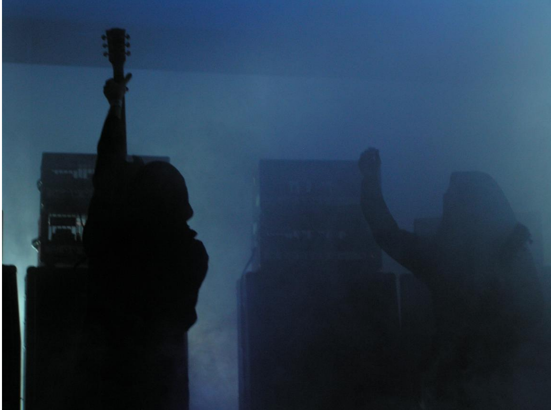
Image 5 SunnO))) Supersonic Festival, Birmingham 2009, image: © Niall Scott

to such a degree that some leave the performance space physically not able to deal with the noise.