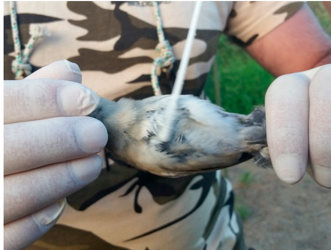
Figure 1. Swab sampling procedure (Ssp).

each bird was transferred to the ringing station, where one expert ringer measured physiological qualitative variables by visually scoring the amount of pectoral muscle and abdominal fat and recording the following standard biometric measures: wing length ( \pm 0.1 mm), tarsus length ( \pm 0.1 mm), and body mass ( \pm 0.1 g) [25]. Every bird was tagged with a unique alpha-numeric ring and was then immediately released.