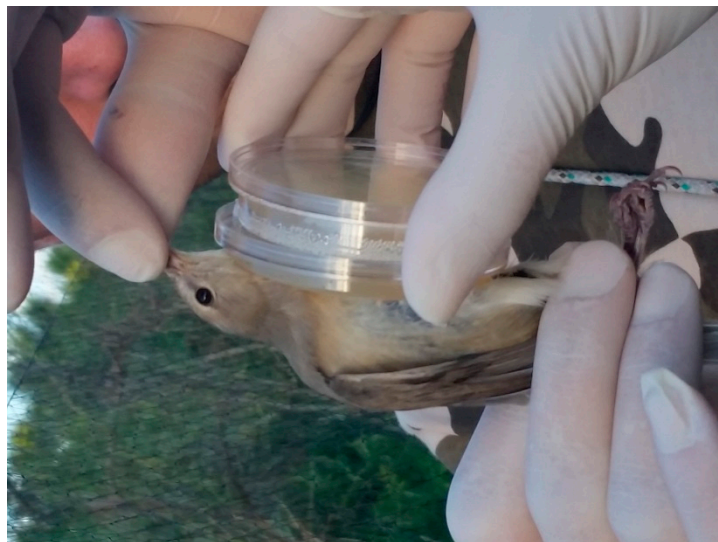
Figure 2. RODAC sampling procedure (Rsp).