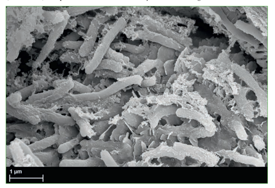
Figure 2 Scanning electron micrograph of microorganisms on corroded carbon steel (AISI 1030).