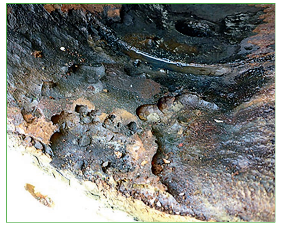
Figure 1 Microbiologically influenced corrosion of crude line to cargo storage in a Floating, Production, Storage and Offloading vessel (FPSO). Reproduced with permission from Machuca and Polomka (2018), Microbiology Australia 39 (3), 165-169.

We know MIC involves the interaction of electrochemical, environmental, operational, and biological factors that often result in substantial increases in corrosion rates to metals in specific environments. However, the complex and dynamic nature of these interactions have made detailed mechanisms elusive, i.e. the precise mechanism(s) of MIC is still being debated among corrosion specialists. The most challenging aspects of MIC is its lack of predictability and the fact that it does not produce a distinct type of corrosion or a unique morphology of corrosion damage, or any sort of mineralogical fingerprints. Although some investigators claim that certain metallurgical features are characteristic of a MIC mechanism, e.g. deep pits that are hemispherical, and cup like in appearance with striation or