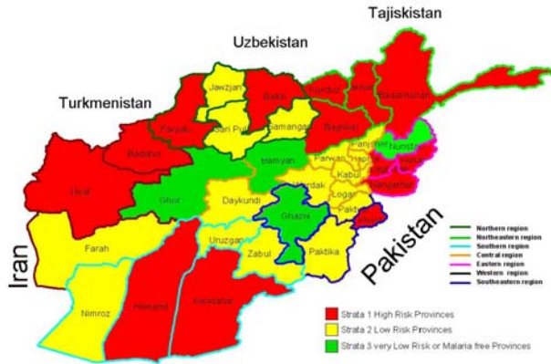
Figure 1 Provincial malaria risk strata. Source: Afghan Ministry of public health (Safi et al., 2009)

Presently, around 60% of the population in Afghanistan is at risk of malaria infection (Asha, May 2003). It is estimated that the highest incidence (23%) is in the Northeast region of Takhar province, followed by Kunduz province (13%). Current malaria strata for all 31 provinces in Afghanistan are shown in Figure 1 (Safi et al., 2009).